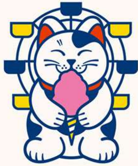
Funfair of Tilburg